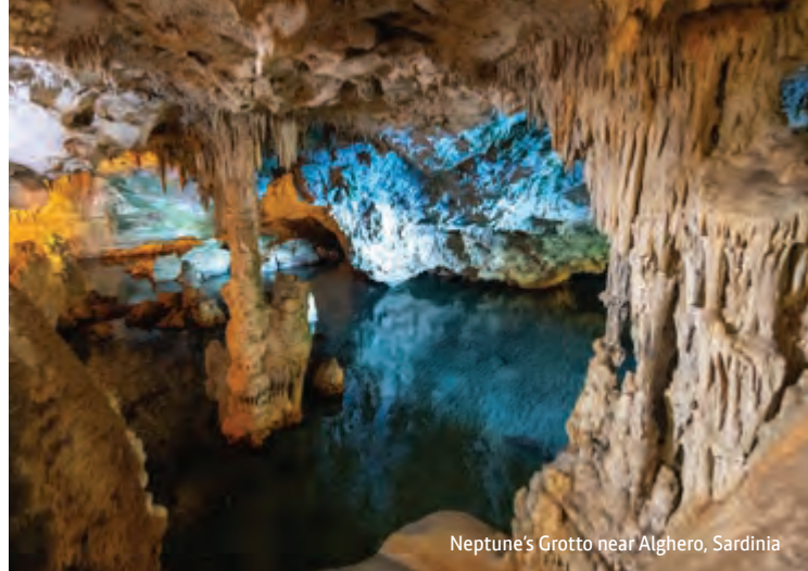
Neptune's Grotto near Alghero, Sardinia