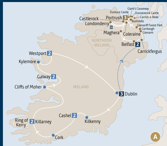
Dark Hedges, Northern Ireland

Having visited Northern Ireland in 2024, I was amazed at the incredible beauty of the landscape, from the Glens of Antrim and the entire Causeway Coastal Route. With so many awe-inspiring attractions, not confined to the UNESCO Heritage Listed Giant's Causeway, this small group journey provides the absolute highlights that this region has to offer.