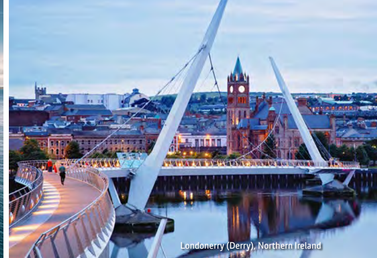
Londonderry (Derry), Northern Ireland