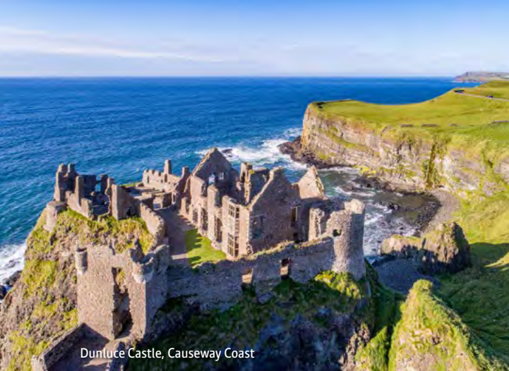
Dunluce Castle, Causeway Coast