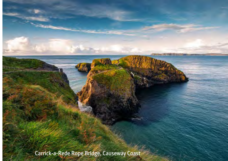
Carrick-a-Rede Rope Bridge, Causeway Coast