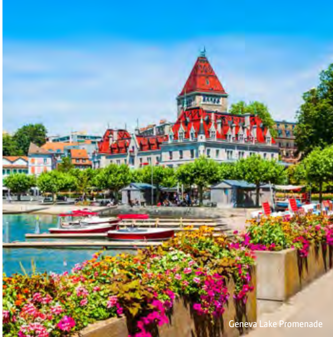
Geneva Lake Promenade