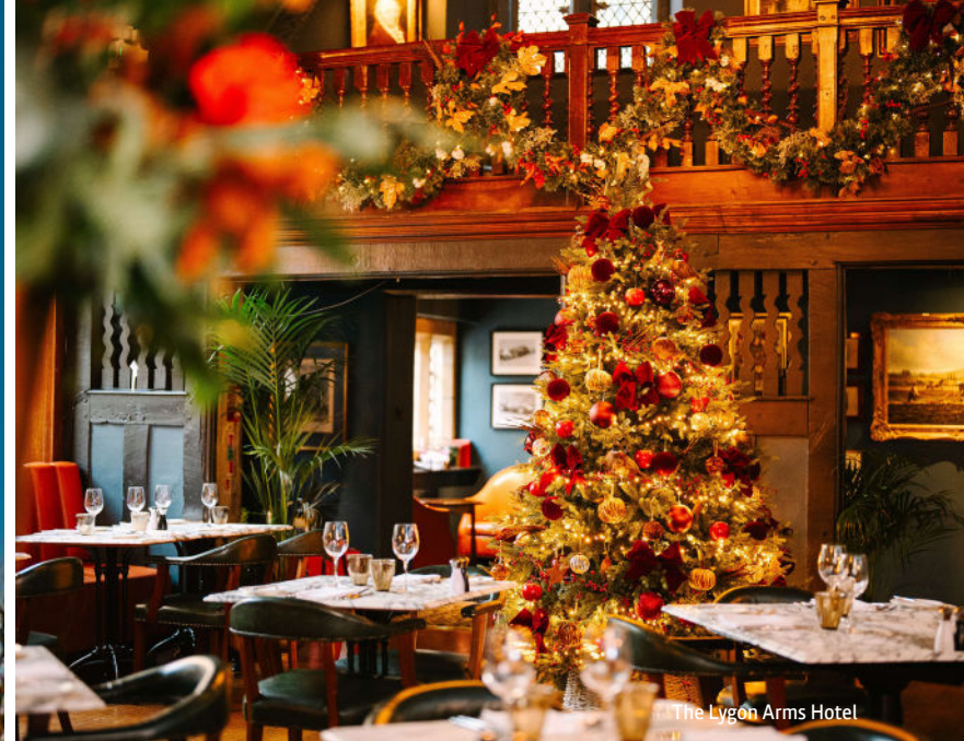
The Lygon Arms Hotel