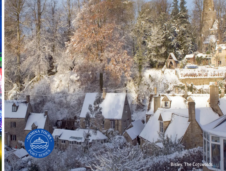
Bisley, The Cotswolds

Embrace the warmth, charm, and magic of an English countryside Christmas with this unforgettable 6-day experience