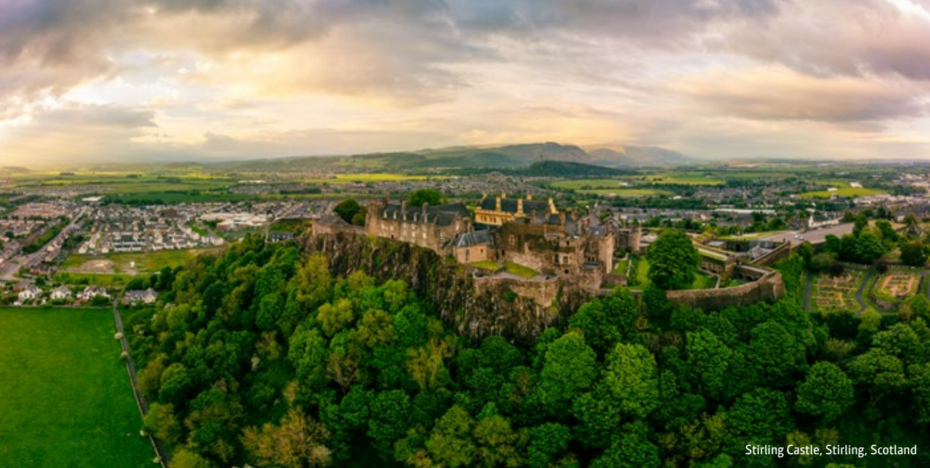
Stirling Castle, Stirling, Scotland