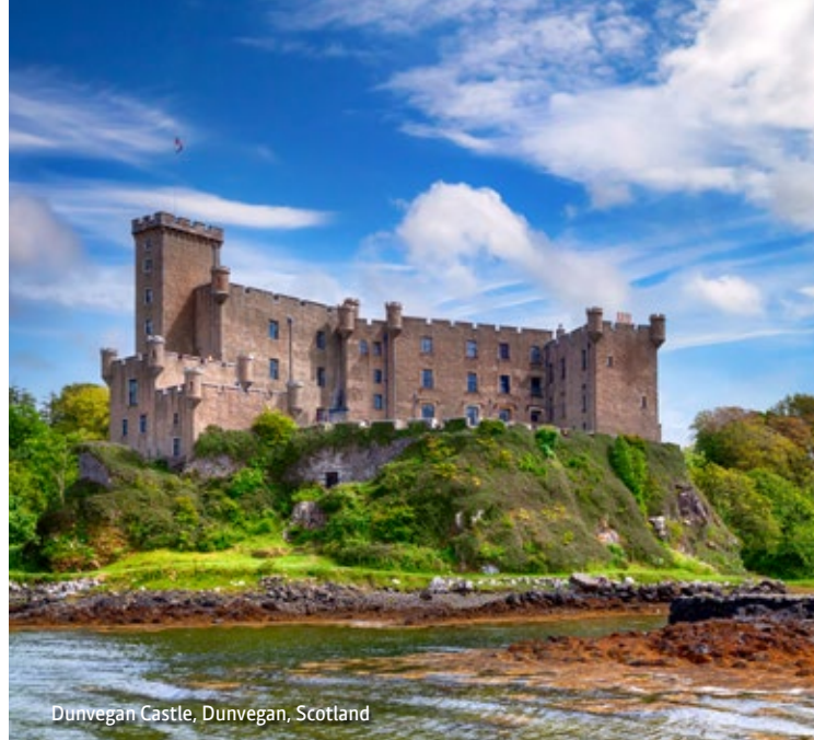
Dunvegan Castle, Dunvegan, Scotland