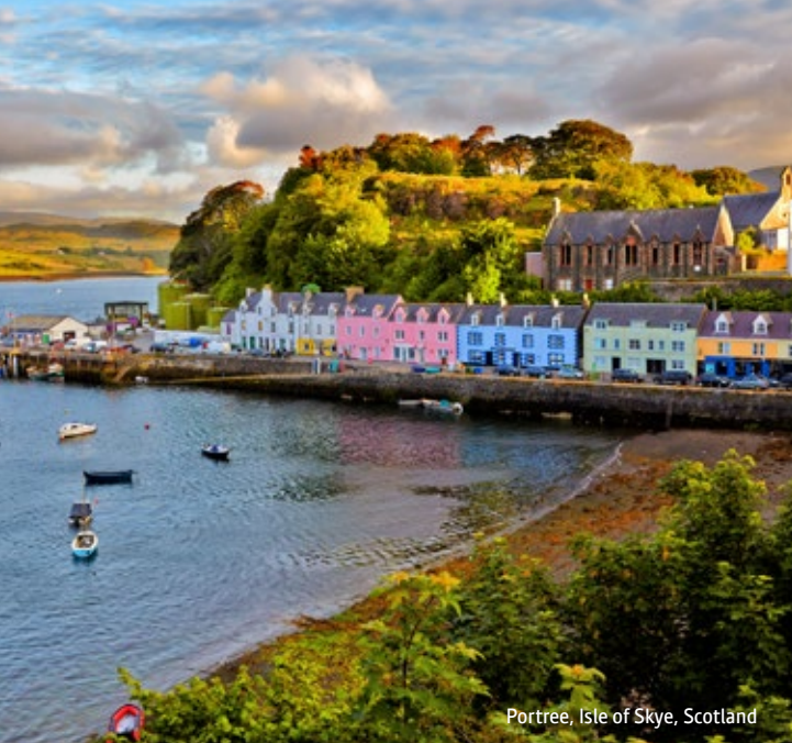
Portree, Isle of Skye, Scotland