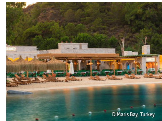
D Maris Bay, Turkey

After breakfast, transfer to Izmir airport for your ongoing journey, or remain in Kuşadasi at your leisure to perhaps embark on a sailing journey around the nearby islands or venture inland to experience Heirapolis-Pamukkale.