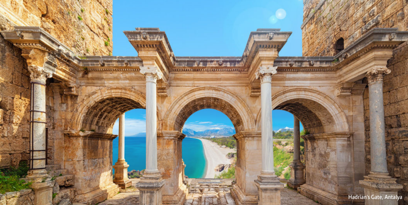
Hadrian's Gate, Antalya