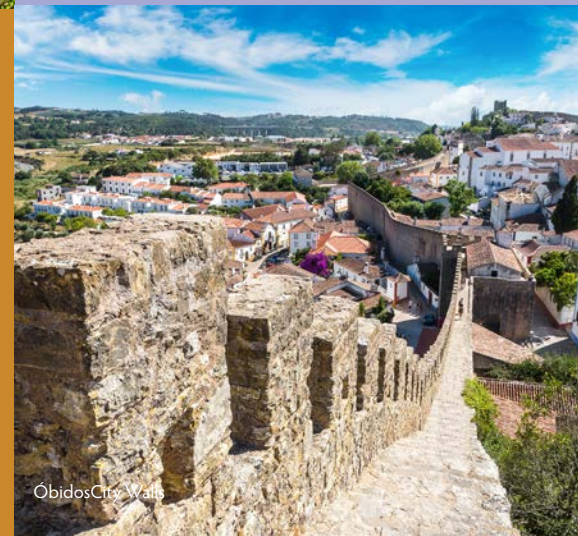
Óbidos City Walls

Adventure atop the ancient city walls of Óbidos, encircling the town since the 8th-11th centuries. Spanning 1.5km around the town's perimeter, the walls offer unique viewpoints with some sections feature shortcuts leading to beautiful viewpoints. Reaching a height of 13m in the highest part, families can marvel at the historic charm and stunning vistas below. Caution: Not for small children and beware those afraid of heights.