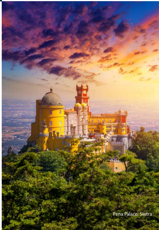
Pena Palace, Sintra