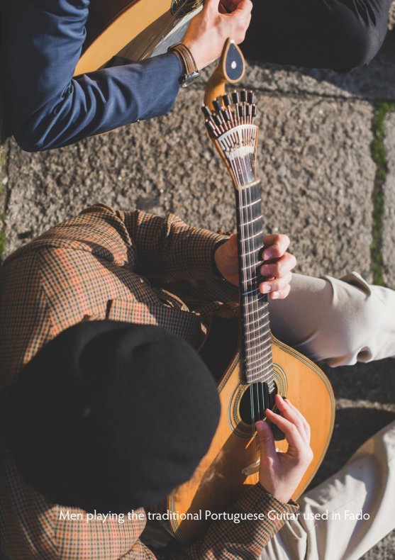
Men playing the traditional Portuguese Guitar used in Fado