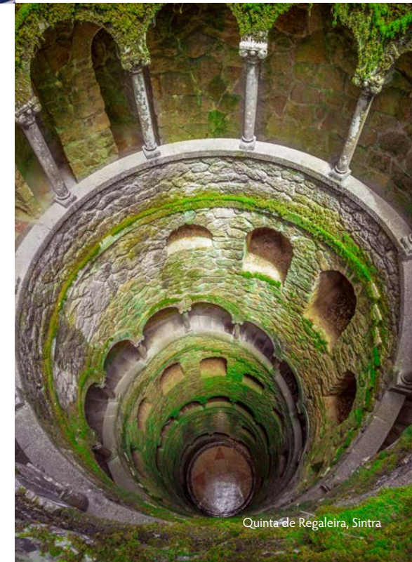
Quinta de Regaleira, Sintra