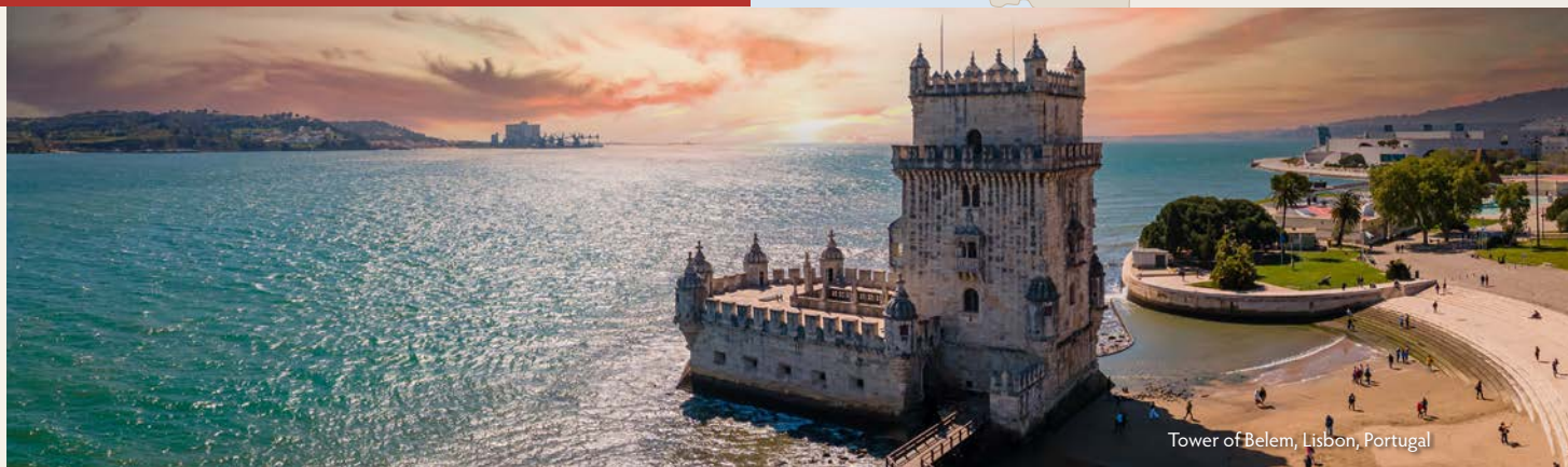
Tower of Belém, Lisbon, Portugal