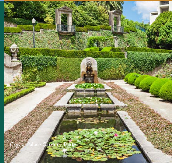
Crystal Palace Gardens, Porto

Portugal is renowned for its family-friendly recreation spaces. We recommend at Parque Eduardo VII in Lisbon, where you can enjoy expansive green areas, a charming duck pond, and the opportunity for kids to sail electric toy boats, it's a haven for families. Meanwhile, Crystal Palace Gardens in Porto is perfect for young botany enthusiasts and is adorned with romantic architecture, features a serene lake, numerous fountains, and a modern public library.