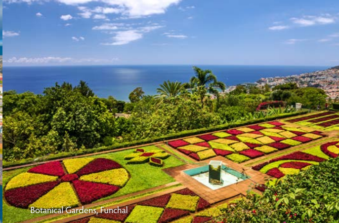
Botanical Gardens, Funchal