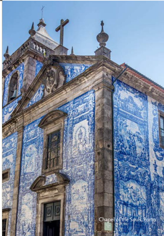
Chapel of the Souls, Porto

Visit the illustrious port houses of Porto, where the timeless tradition of Portugal's iconic Port wine unfolds, tracing its roots to the 17th century. Delight in a tasting session at these historic establishments, savouring the rich and distinctive flavours that define this legendary fortified wine. Immerse yourself in the authentic atmosphere of Porto's celebrated port wine cellars, home to revered names like Graham's, Taylor's, and Sandeman, each contributing to the legacy of this esteemed beverage.