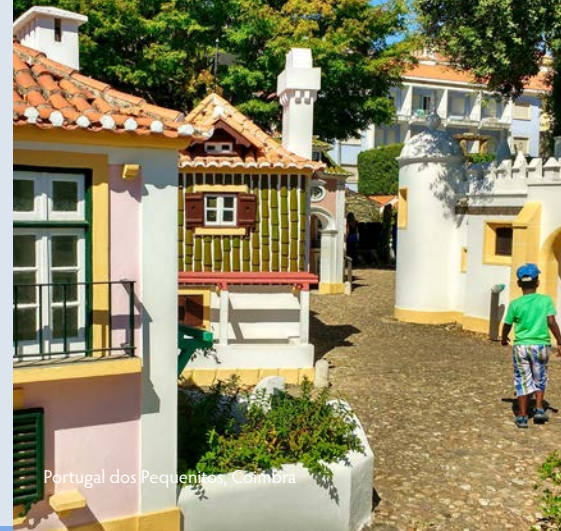
Portugal dos Pequenitos, Coimbra

Portugal stands out as one of the most family-friendly countries in Europe. Embracing a child-centric culture, little ones are warmly received everywhere – be it museums, restaurants, town squares, or theatres. Cities abound with parks and playgrounds, while the country's untouched landscapes and magical palace gardens create a natural paradise, offering families a welcoming haven. In addition to our already mentioned family-friendly activities, here are some more you can add for the perfect family itinerary through Portugal.