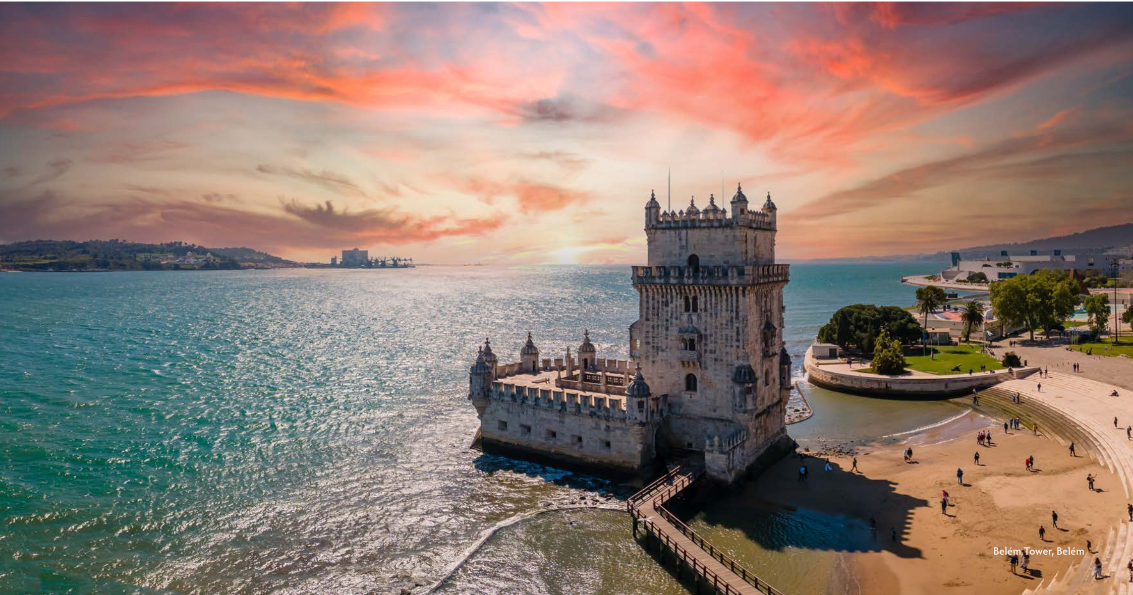
Belém Tower, Belém