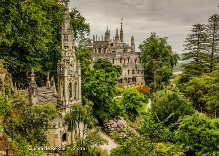
Quinta de Regaleira, Sintra