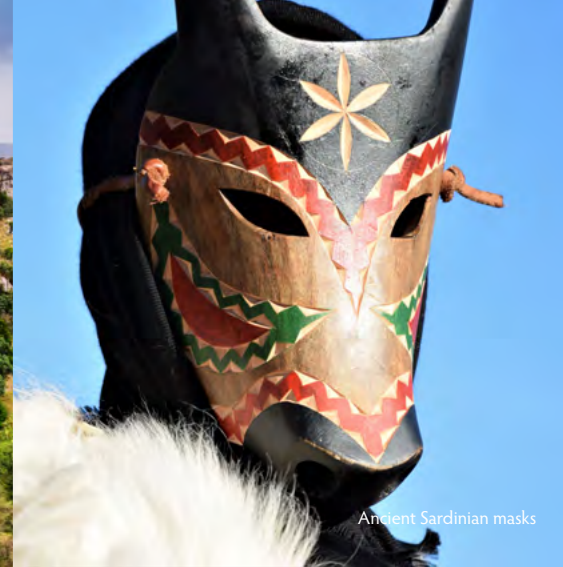
Ancient Sardinian masks