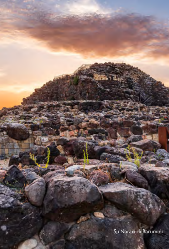
Su Nuraxi di Barumini