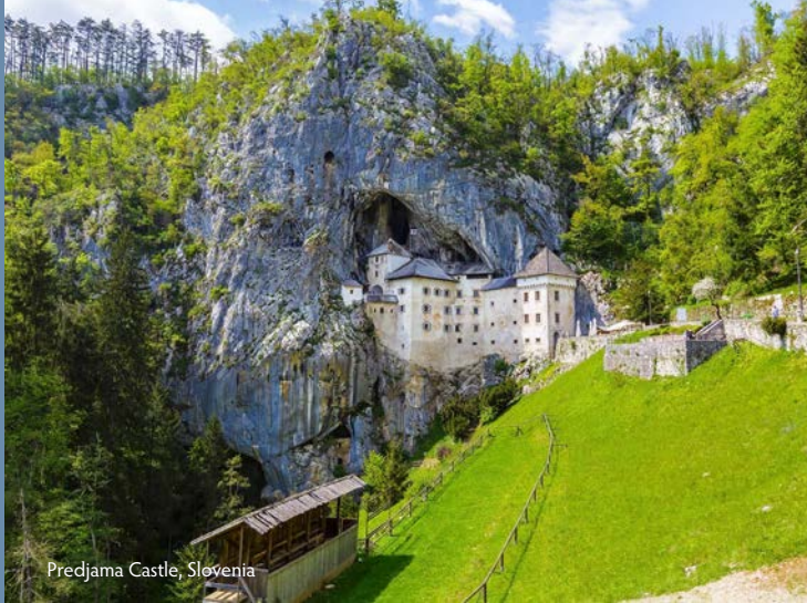
Predjama Castle, Slovenia