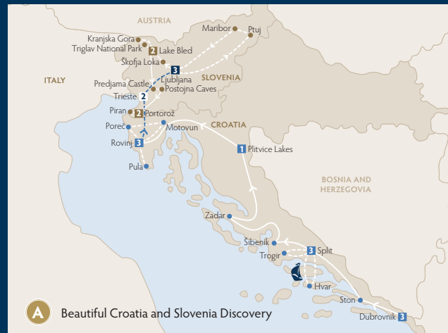
A Beautiful Croatia and Slovenia Discovery

* All prices are listed in AUD unless otherwise stated. Prices in other currencies are available on our website.