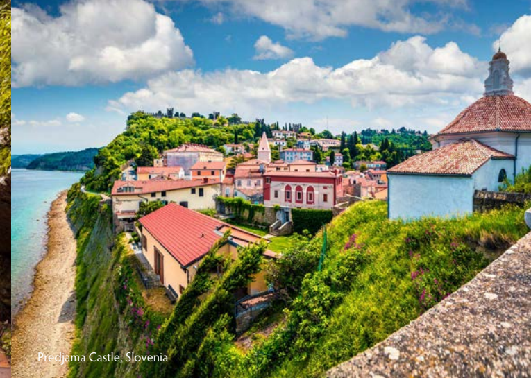
Predjama Castle, Slovenia