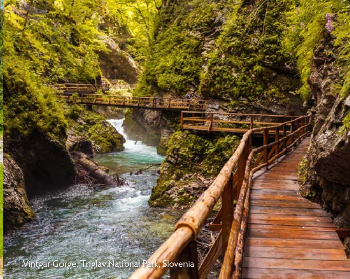
Vintgar Gorge, Triglav National Park, Slovenia