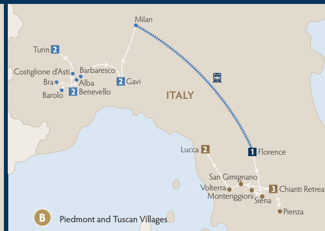
B Piedmont and Tuscan Villages