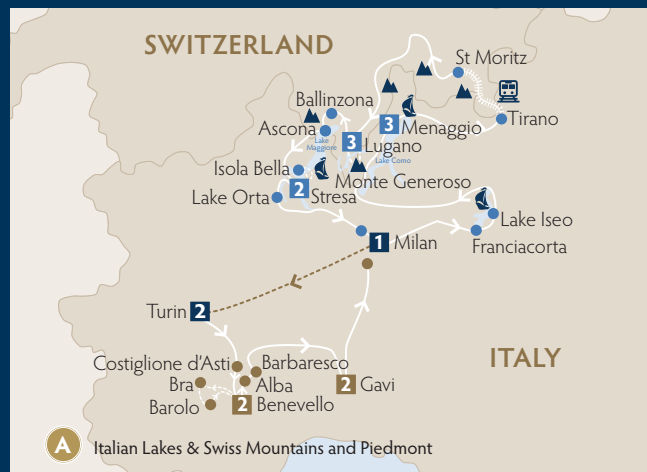
A Italian Lakes & Swiss Mountains and Piedmont