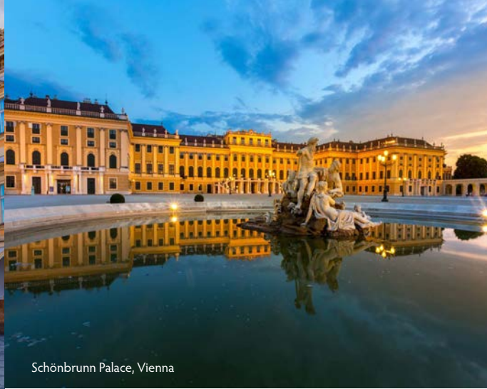
Schönbrunn Palace, Vienna