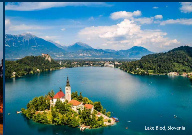
Lake Bled, Slovenia