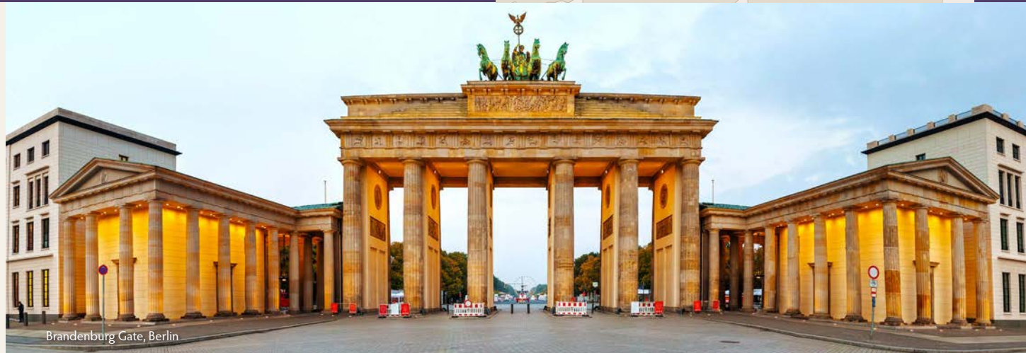
Brandenburg Gate, Berlin