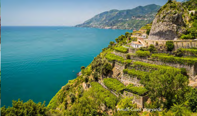
Amalfi Coast Vineyards