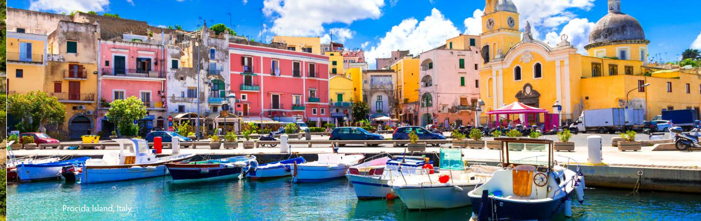
Procida Island, Italy