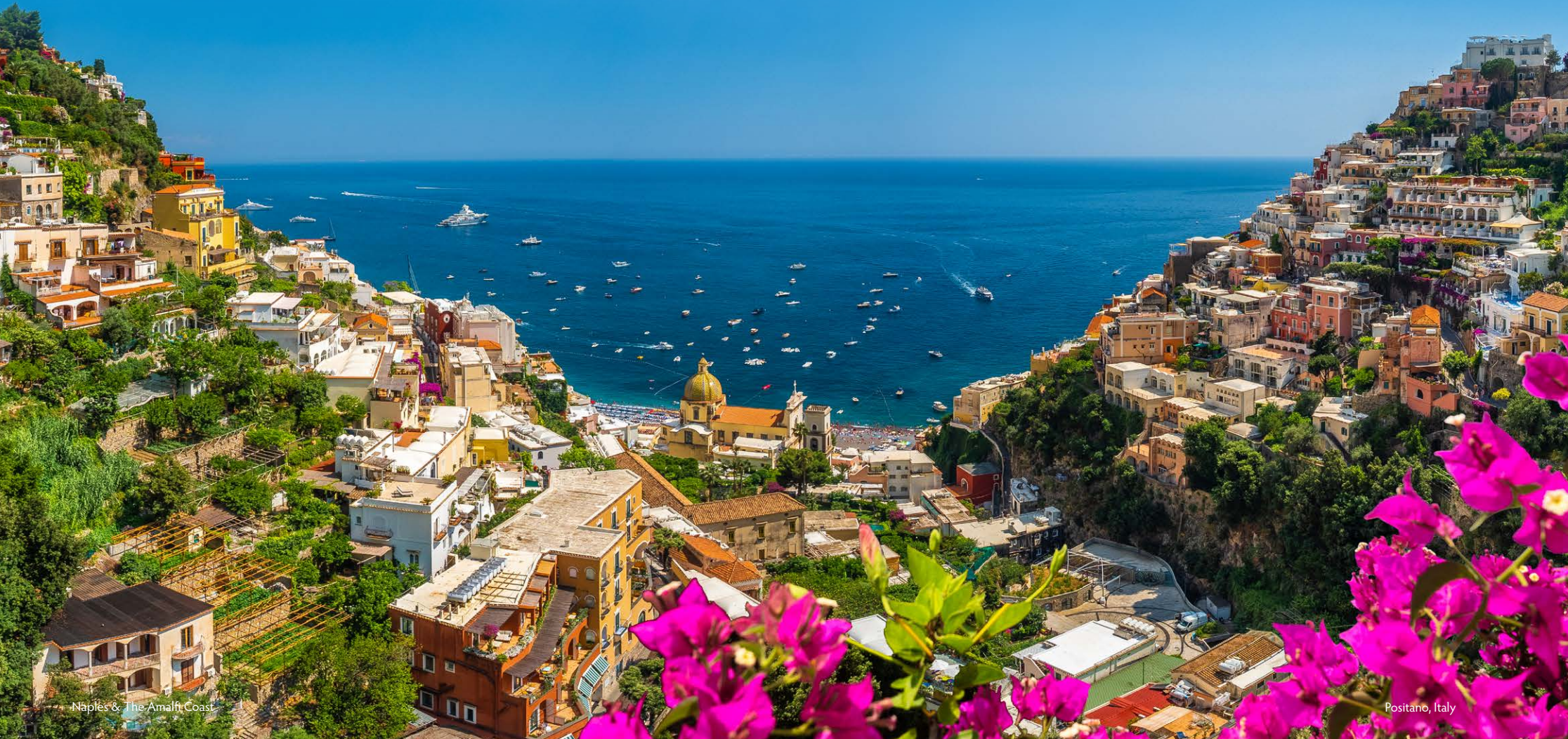
Naples & The Amalfi Coast

"TO TRAVEL IS TO LIVE." HANS CHRISTIAN ANDERSEN