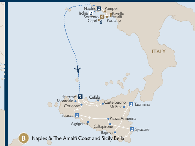
B Naples & The Amalfi Coast and Sicily Bella