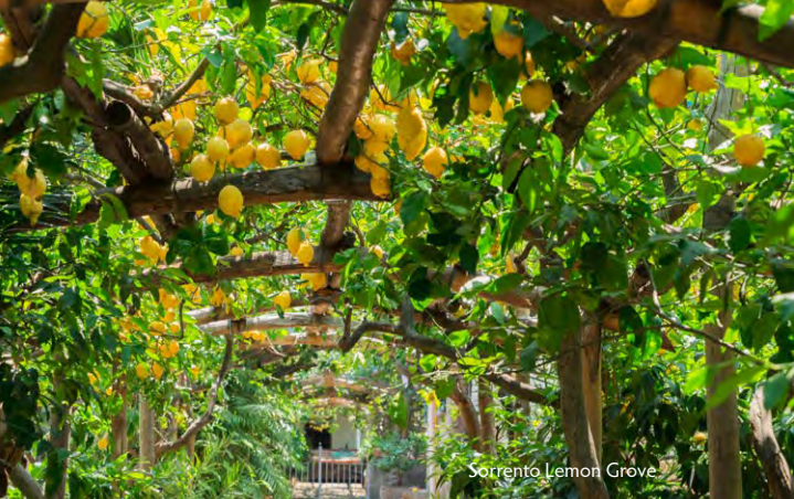
Sorrento Lemon Grove