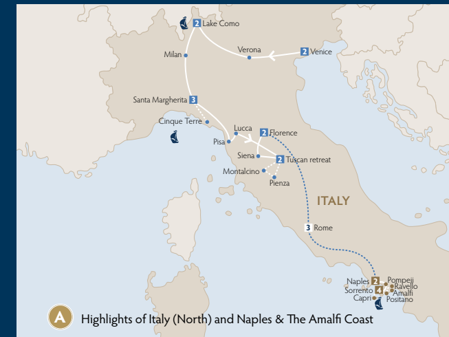
A Highlights of Italy (North) and Naples & The Amalfi Coast