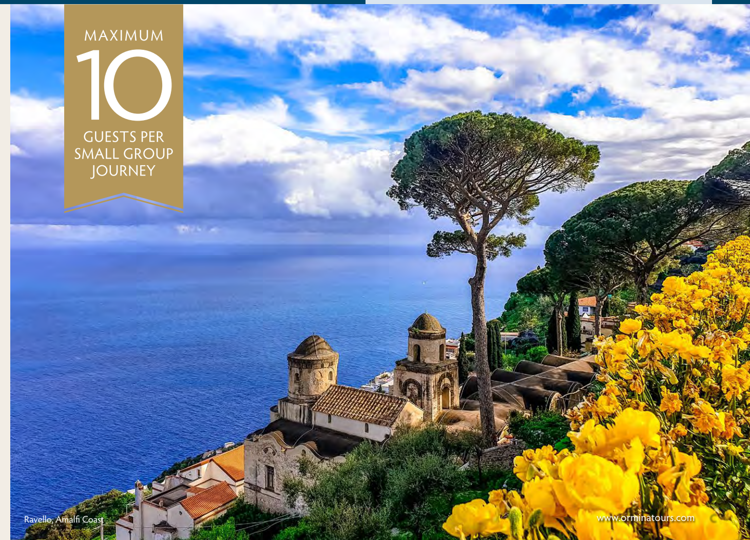
Ravello, Amalfi Coast