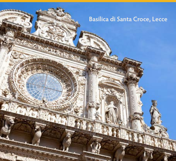
Basilica di Santa Croce, Lecce