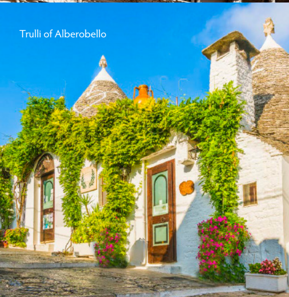
Trulli of Alberobello