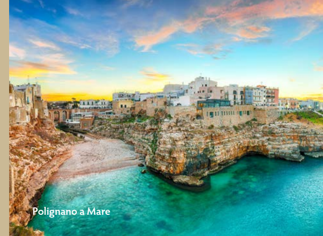
Polignano a Mare