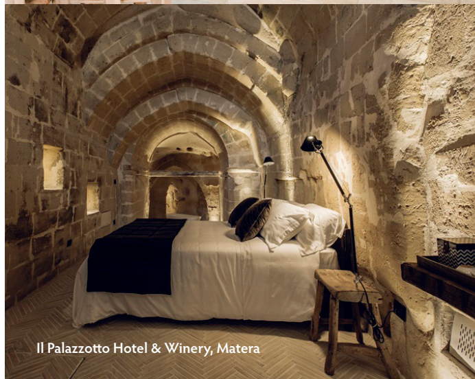
Il Palazzotto Hotel & Winery, Matera