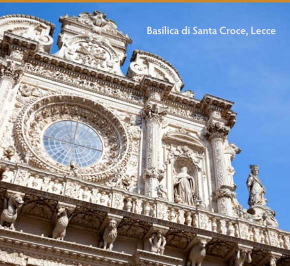
Basilica di Santa Croce, Lecce