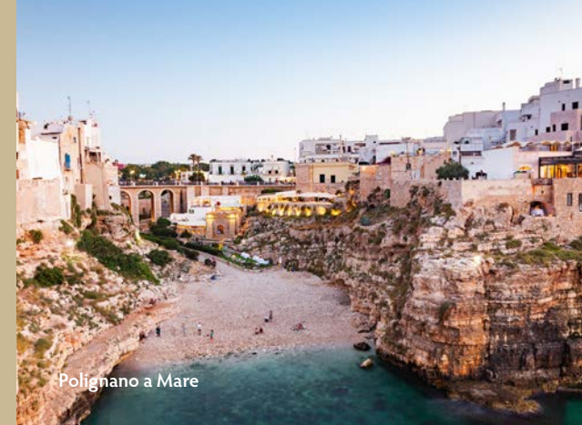
Polignano a Mare