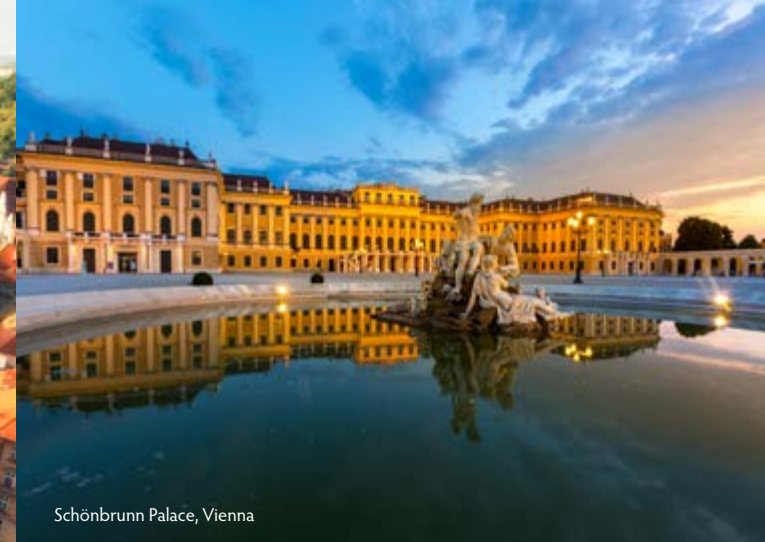
Schönbrunn Palace, Vienna