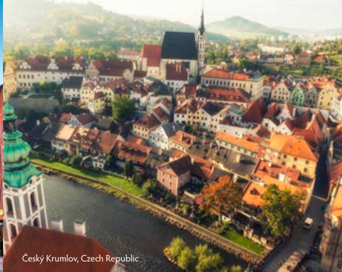
Český Krumlov, Czech Republic