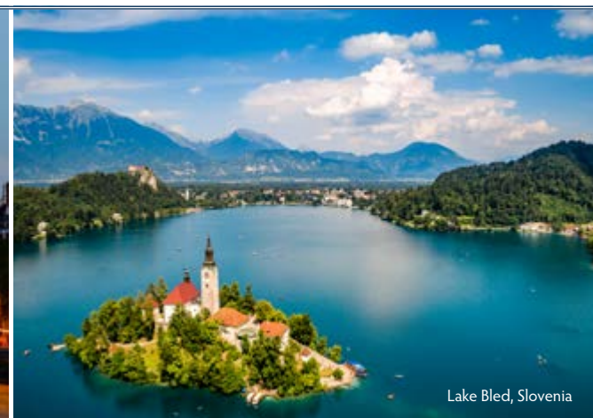
Lake Bled, Slovenia