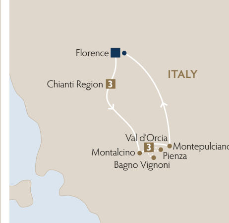
Food & Wine, In-Depth