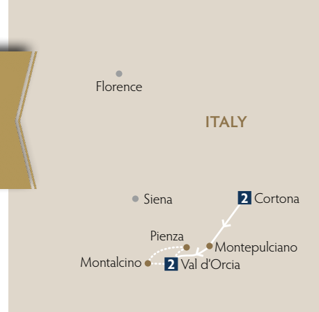
Food & Wine Tasting

Discover the rolling hills of Tuscany your way. Our itineraries are designed to give you the best experiences of Tuscany. Visit the most amazing towns, be treated to gastronomic delights, and enjoy time to relax and unwind.