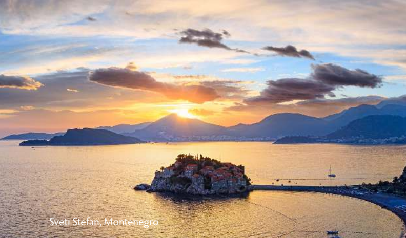
Sveti Stefan, Montenegro