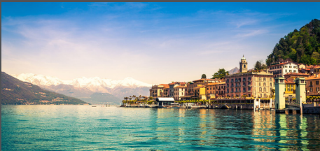
Lake Como 5 Days from $3,690pp