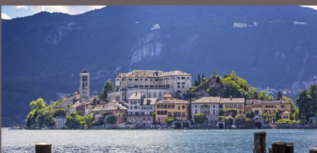
Italian Lakes & Swiss Mountains