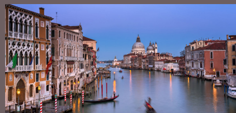
Highlights of Italy (North)