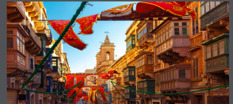
Malta 7 Days from $3,690pp