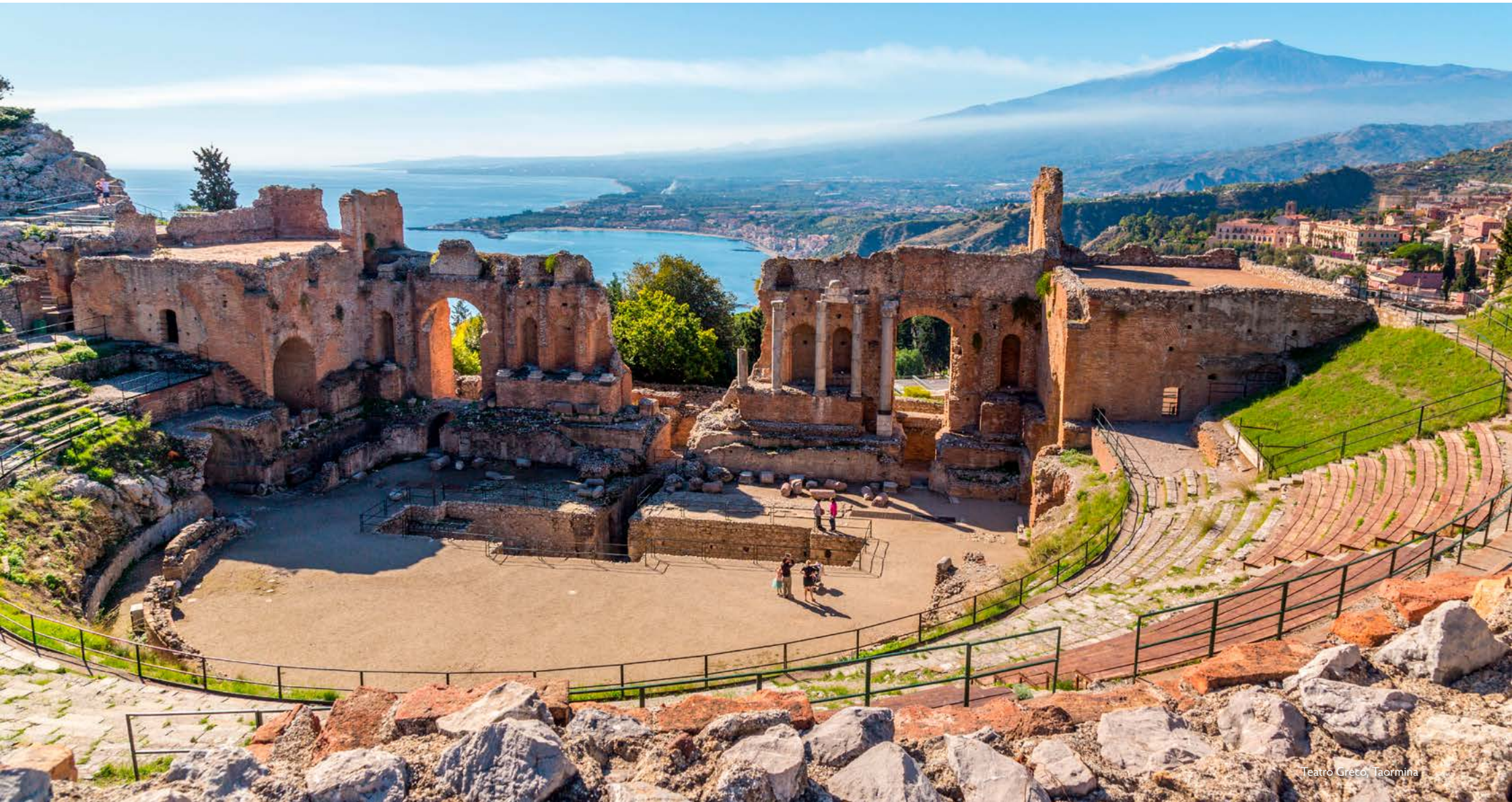
Teatro Greco, Taormina