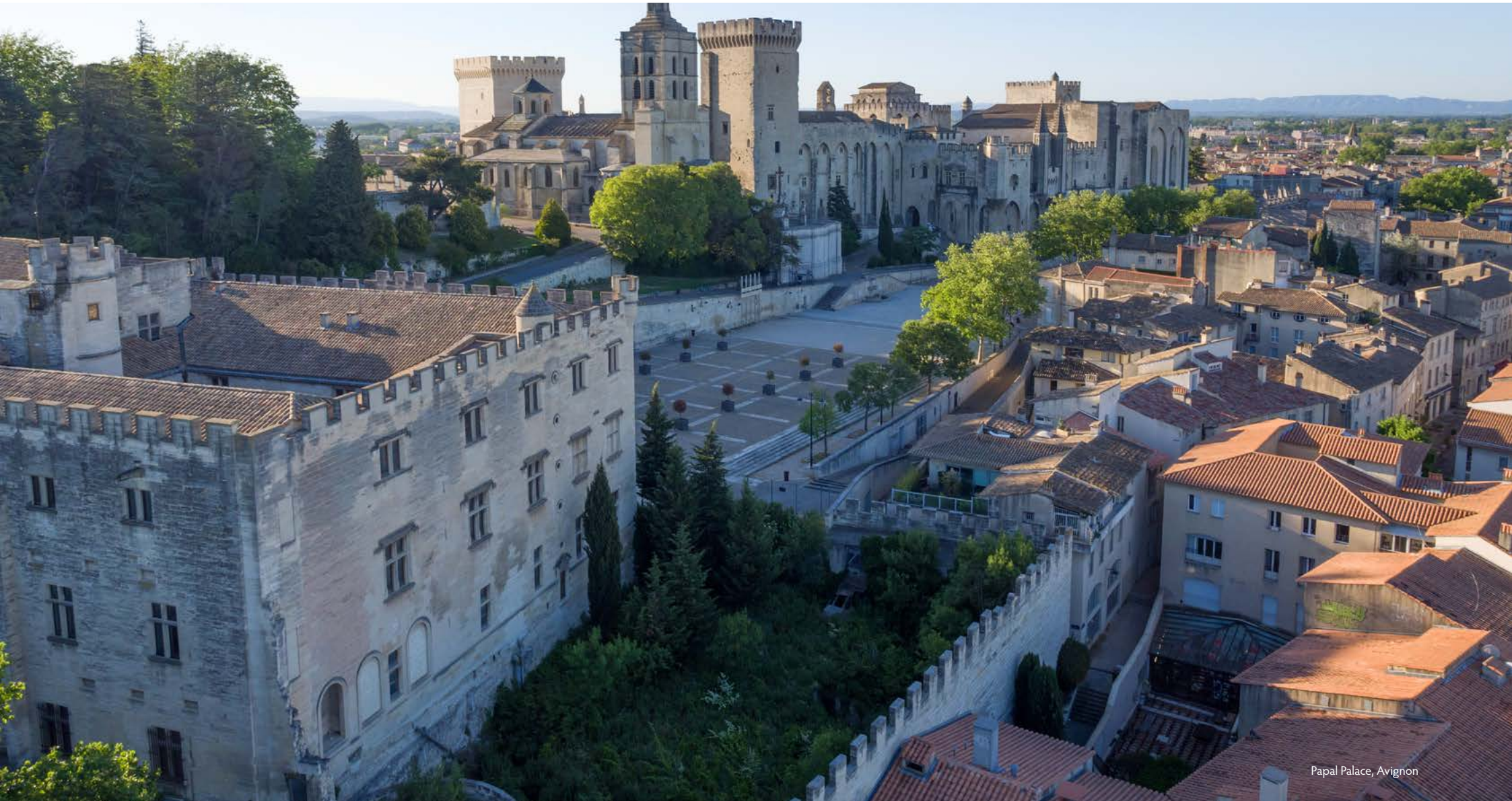
Papal Palace, Avignon