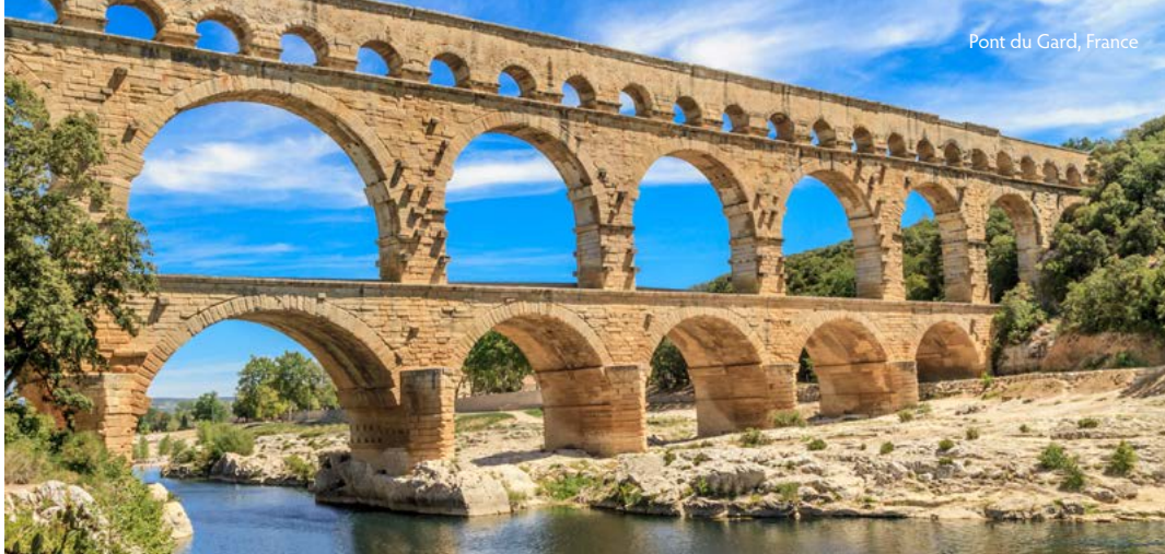
Pont du Gard, France