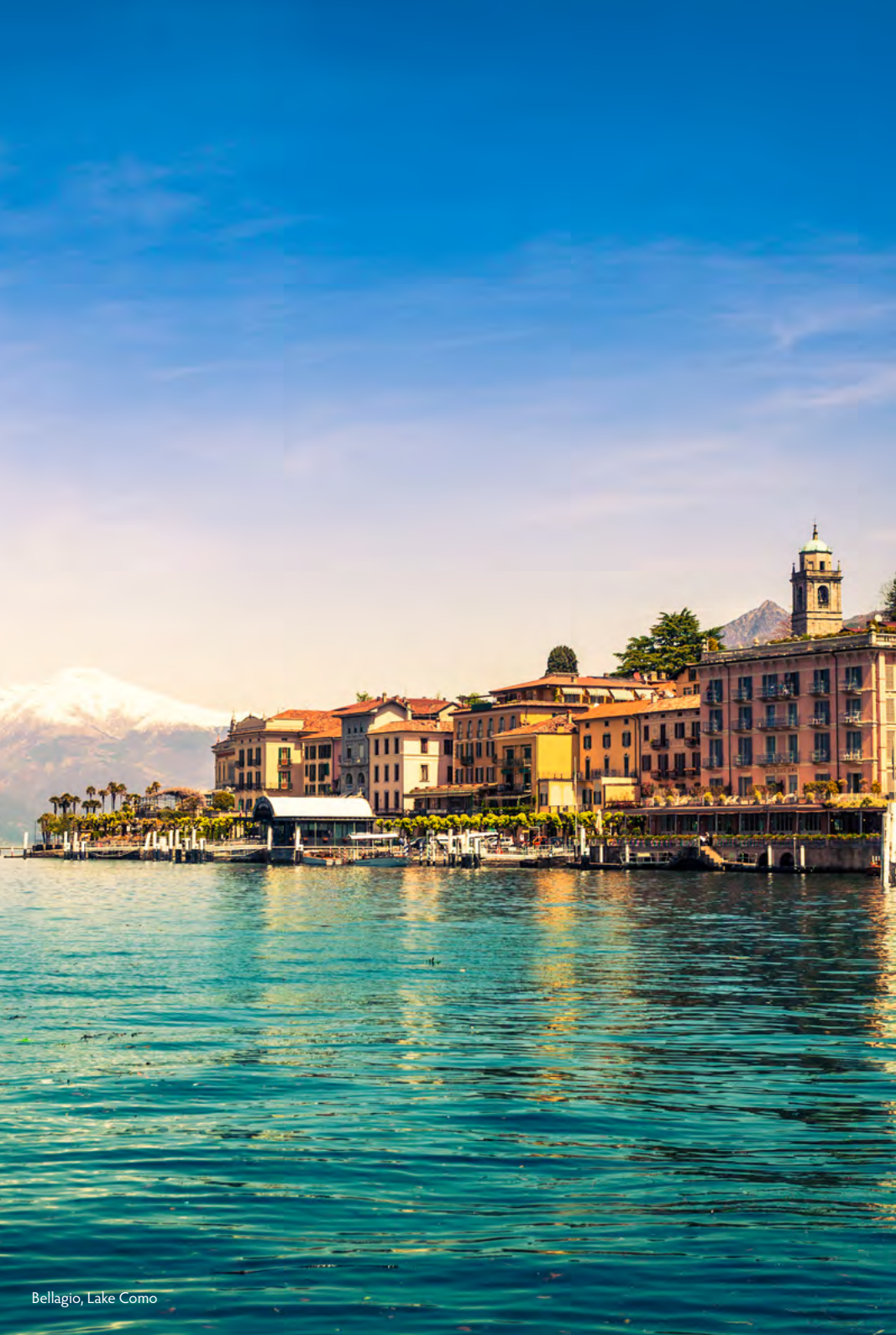
Bellagio, Lake Como