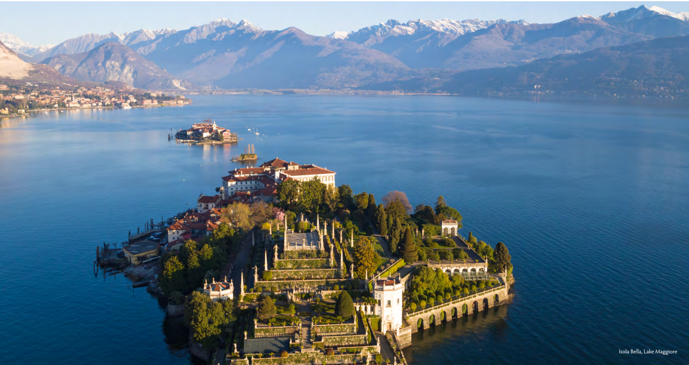
Isola Bella, Lake Maggiore